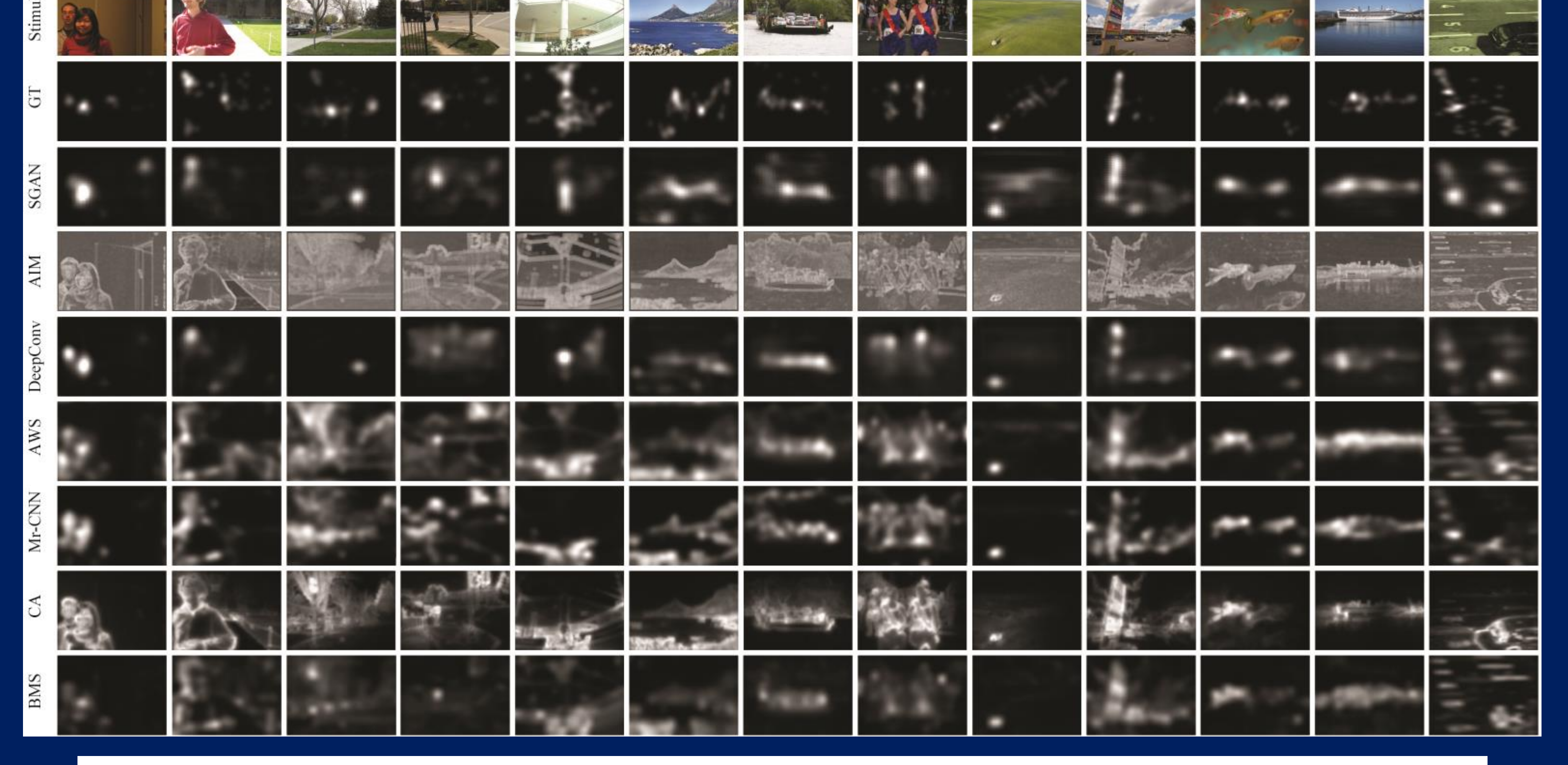
Fig. 3. Qualitative results. We compare our results (SGAN) with six saliency prediction models, namely AIM, DeepConv, AWS, Mr-CNN, CA, BMS. The first row shows the input images from the Cerf (the first 2 columns), MIT1003 (the 3rd to 10th columns). The second row illustrates ground truth maps. The other rows are saliency maps of all the seven models.

Determining the learning rates of both generative net and discriminative net to make training successfully. The learning rates of two sub-networks are the most fundamental parameters in the whole system. By coordinating the two learning rates, the distribution of input data can be learned efficiently, which helps to promote the accuracy. Considering that discriminative net is adapted as feature extraction to yield the final maps, its output - the judgement result is important and should not be fooled by generative net. Meanwhile, the usage of generative net is to analyse and learn the distribution of the source image. It is worth noting that we pay no attention to the generated images from the generative net. Consequently, generative net is designed to be beaten by discriminative net and thus the learning rate of generative net is smaller than that of discriminative net. Experimental details are described in the next section.