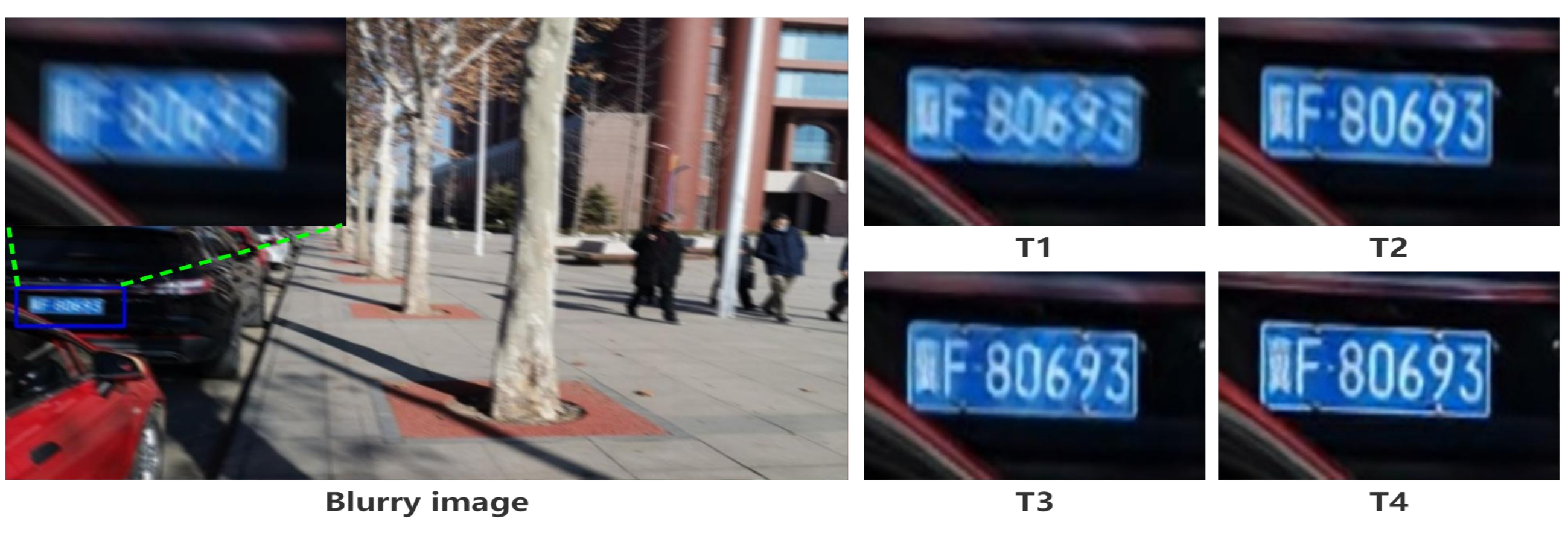
Fig.4. Visual comparison of different training data selection schemes on DCLData dataset.

In this paper, a double closed-loop network was proposed for deblurring task. Different from prior work which merely focused on constructing a single network to straightly recover a sharp image from the blurry one, we introduced two closed-loop structures into our model which could effectively improve the deblurring performance. Moreover, we also extended the loss function of our model to deal with the unpaired samples in the dataset. Through extensive experiments on benchmark datasets and a real-world dataset, the advantage of our network over other state-of-the-art methods has been demonstrated.