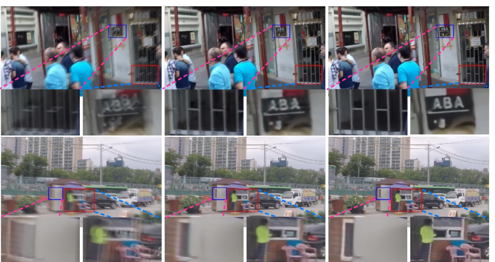
(c)Tao et al.[2] (a)Blurry image (b)DMPHN[4] (d)Ours Fig. 2. Visual comparison of the deblurring results on GoPro dataset.