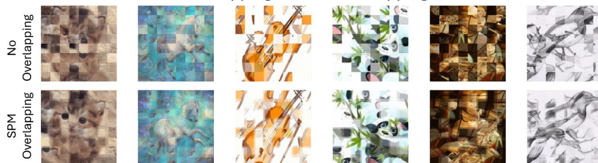
Figure S3. Example images showing SPM Patch overlapping versus non-overlapping.