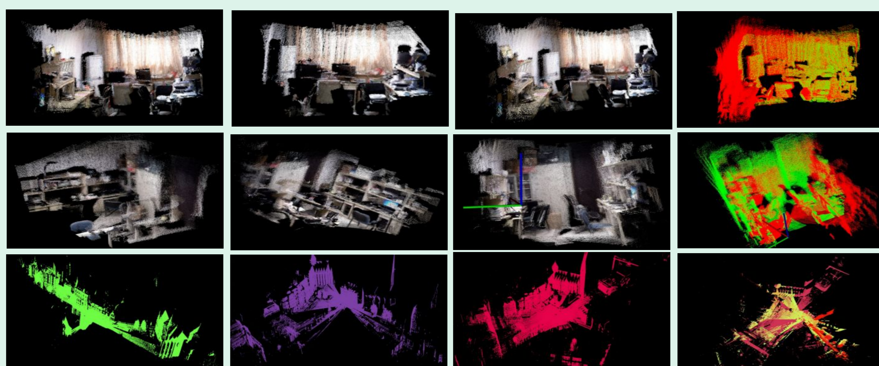
Fig.2. The 1st and 2nd column represent the source point cloud and target point cloud. The 3rd and the 4th column represent our method results

We divide the transformation accuracy of different methods into 10 intervals, and number from 1 to 10 represents the level of accuracy. The number is bigger the result is better. Table 1 shows the time consumption and accuracy comparison.