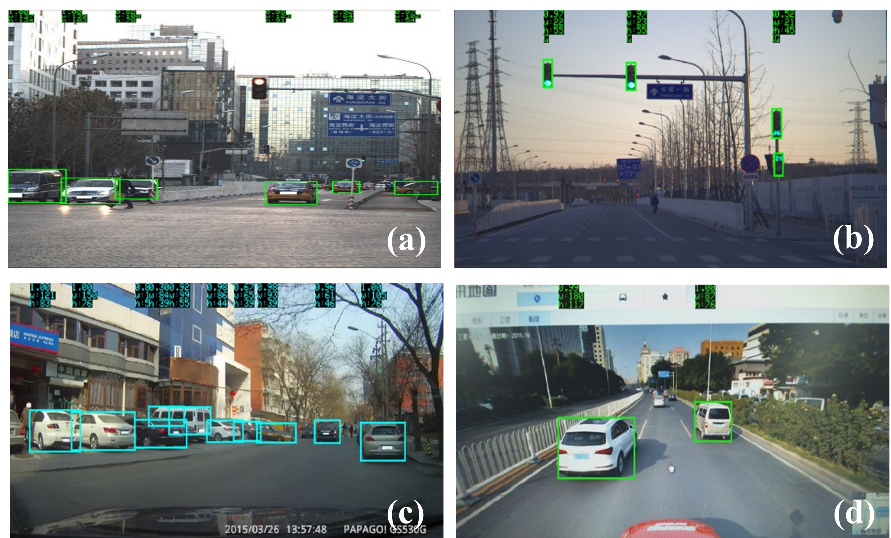
Fig. 3. The trained models (eg. DetectNet) using TAD16K can be directly deployed for real applications. (a) PointGrey frames. (b) Basler frames. (c) Common car driving recorders. (d) Common web cameras.