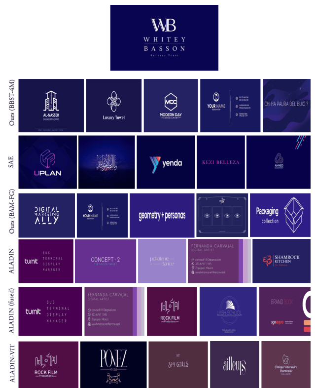
Fig. 2. Style-based image retrieval comparison between our method variants and previous literature.