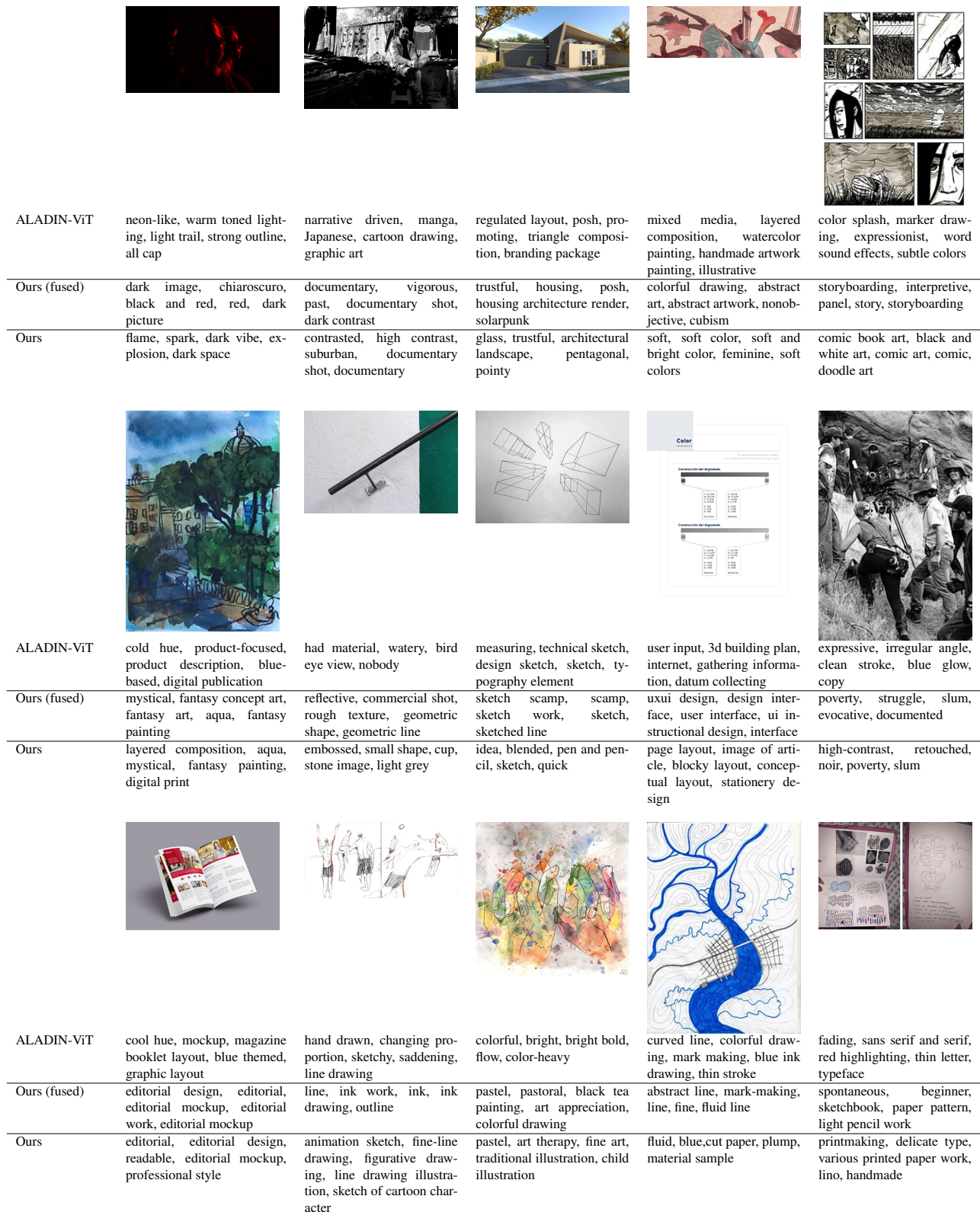
Fig. 1. Please zoom for more image detail. Zero-shot automatic style tagging comparison, between ALADIN-ViT, our model, and our fused variant, joining our disentangled embeddings with ALADIN-ViT. We show the top 5 tags for each image.