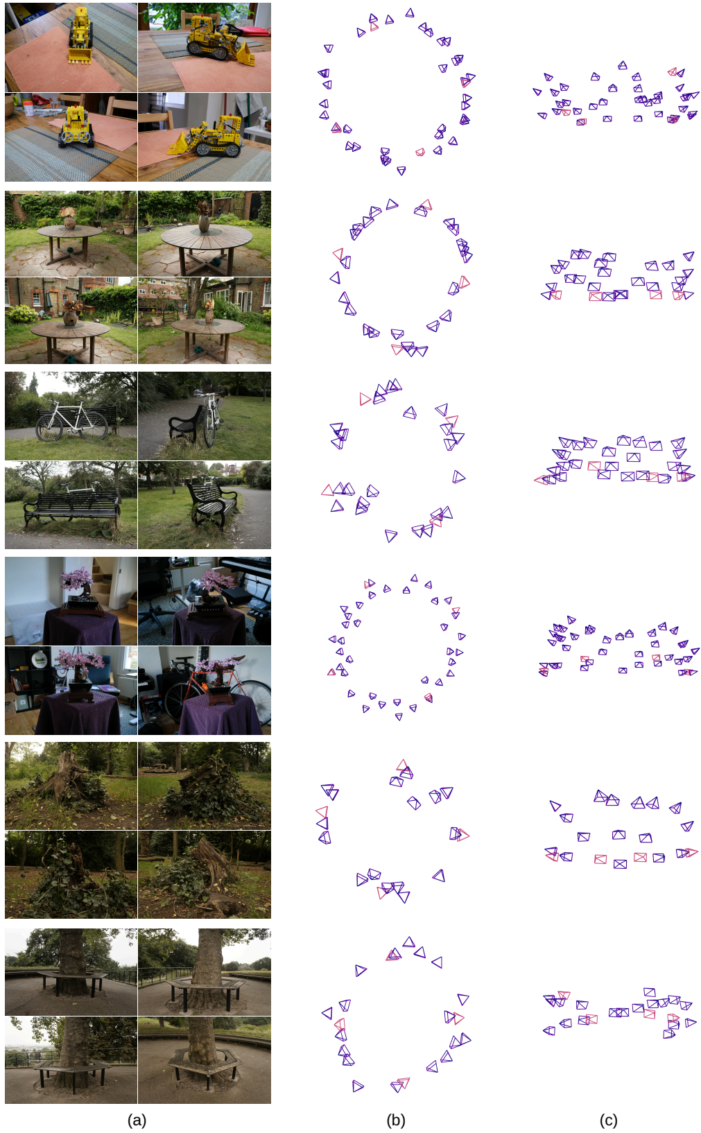
Fig. 2: Training images and camera distribution for selected scenes—Kitchen, Garden, Bicycle, Bonsai, Stump, and Tree-hill—from the Mip-NeRF 360 dataset. (a) Training images; (b) top view of camera distribution with training cameras in red and test cameras in blue; (c) side view of camera distribution with training cameras in red and test cameras in blue.