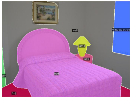
Figure: Case Study 2. Out-of-vocabulary class: lamp, window screen