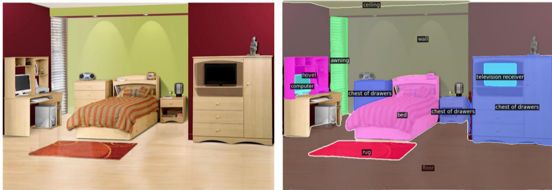
Figure: Case Study 1. Out-of-vocabulary class: computer, chest of drawers.